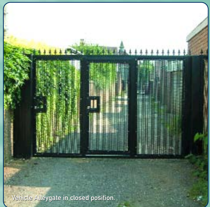
Vehicle Alleygate in closed position.