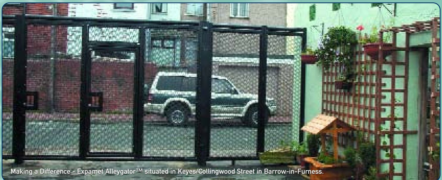
Making a Difference - Expamet Alleygator™ situated in Keyes/Collingwood Street in Barrow-in-Furness.