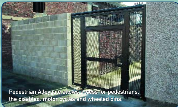
Pedestrian Alleygate allows access for pedestrians, the disabled, motor cycles and wheeled bins.

Up to 80% of burglaries occur via the rear of a property. The Alleygates have the potential to impact on almost all aspects of crime and other forms of anti social behaviour, such as alcohol and drug abuse, prostitution, arson, fly tipping and littering. The Alleygates also cut off the thieves 'rat run' which restricts their ability to commit street crimes. Alleygating can substantially improve the quality of life of residents, and in doing so enhance community spirit.