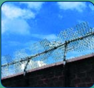
Anti vandal scaling barrier